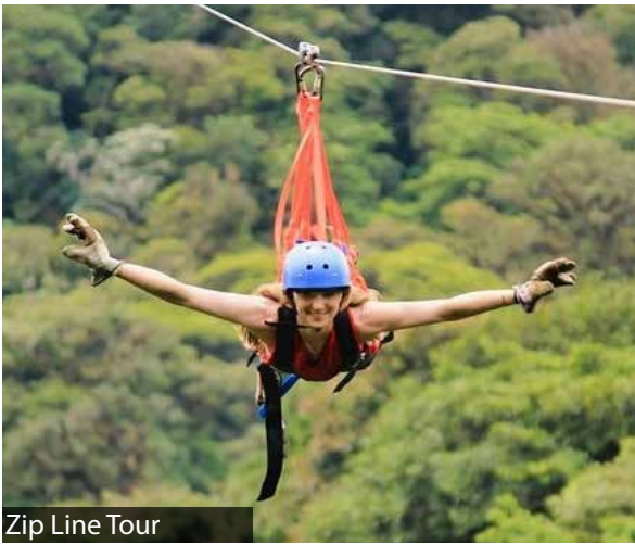
Zip Line Tour