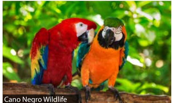
Cano Negro Wildlife