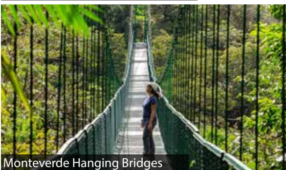
Monteverde Hanging Bridges

FREE TIME SUGGESTIONS If you have some extra time to explore San Jose before your tours begin, you'll find plenty to do! San Jose is a modern city located in central Costa Rica and offers an appealing variety of historic buildings, museums, and interesting sightseeing. Perhaps visit the popular Spirogyra Butterfly Garden, a small piece of paradise within walking distance from the busy streets of San Jose.