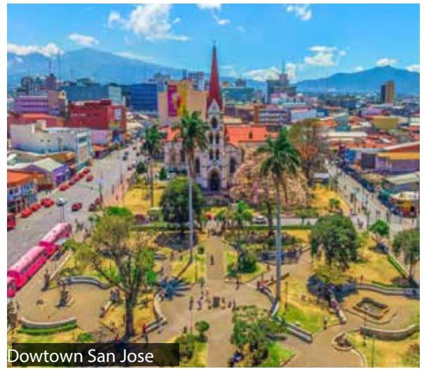
Downtown San Jose