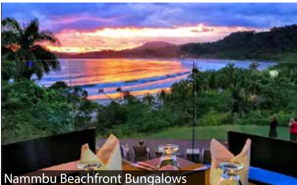
Nambu Beachfront Bungalows