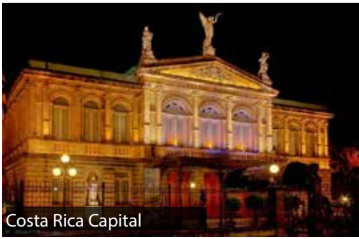
Costa Rica Capital