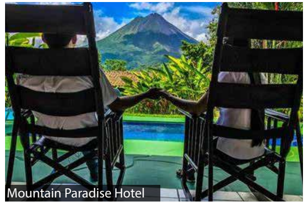
Mountain Paradise Hotel