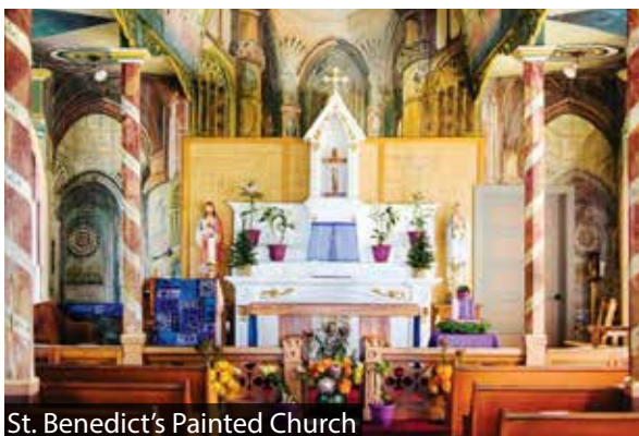
St. Benedict's Painted Church