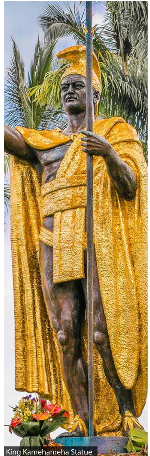
King Kamehameha Statue

A deposit of $698 per person is due upon reservation. Reservations are made on a first-come, first-served basis. Reservations made after the deposit due date of July 2, 2024 are based upon availability. Final payment due by October 10, 2024. Deposits are refundable up until July 9, 2024.