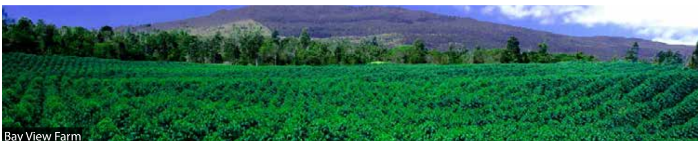
Bay View Farm