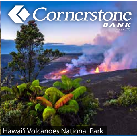
Hawai'i Volcanoes National Park