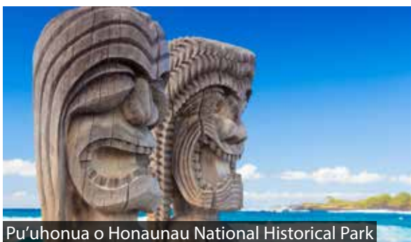
Pu'uhonua o Honaunau National Historical Park