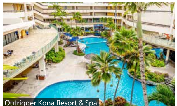
Outrigger Kona Resort & Spa