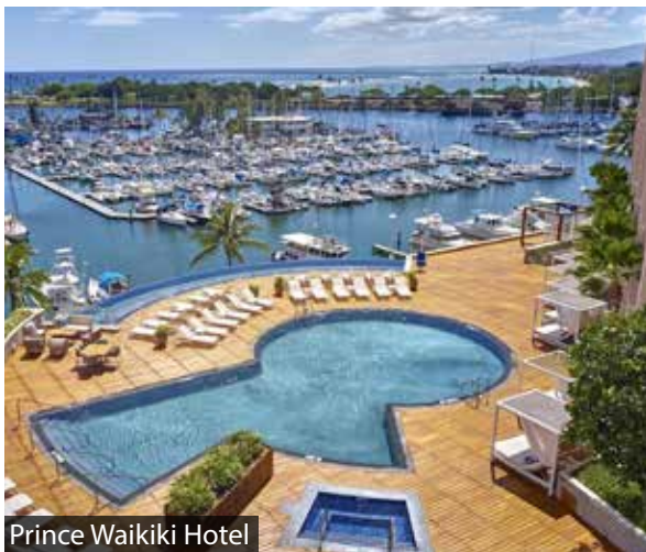
Prince Waikiki Hotel