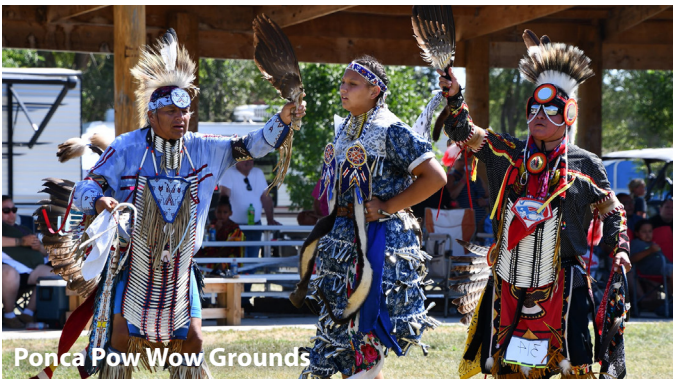
Ponca Pow Wow Grounds